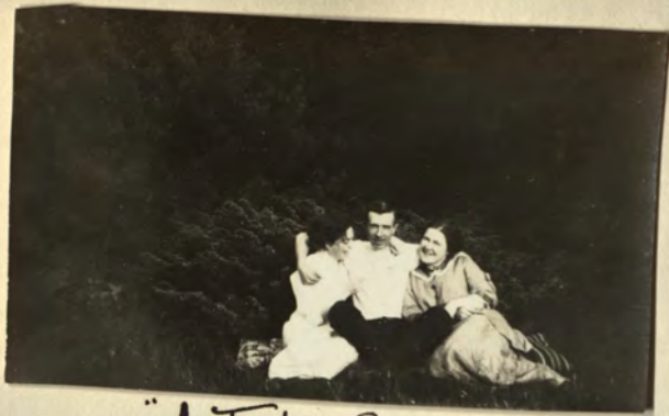
"A Touching Scene."