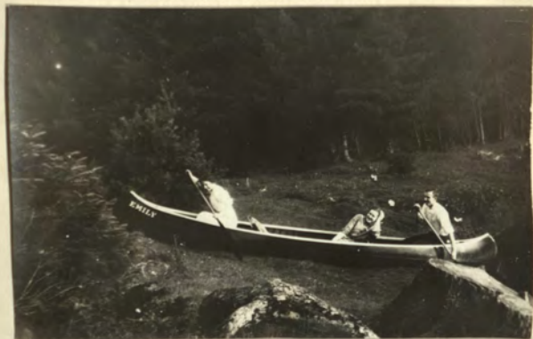
Landing is sometimes strenuous.