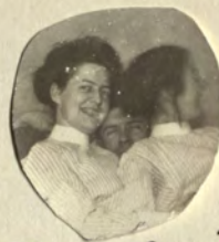
"Two on Stan!"