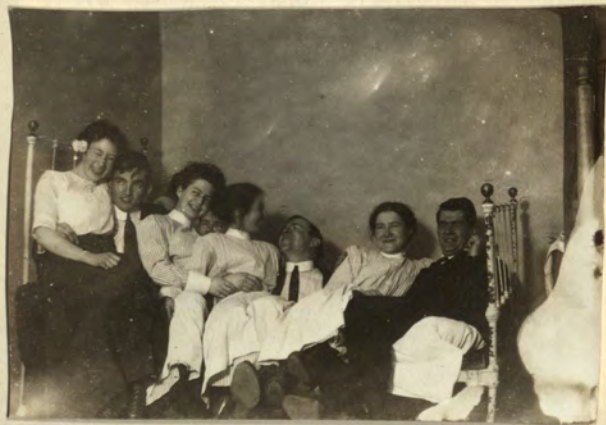
"A solemn occasion."