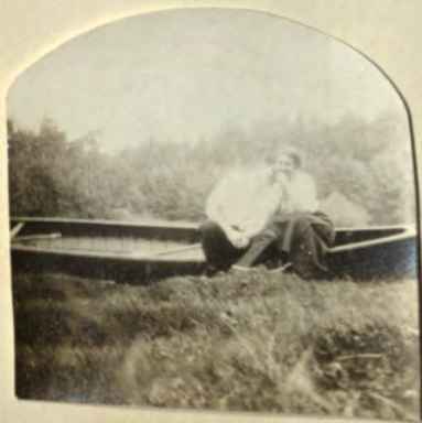
"Lost in the Fog."