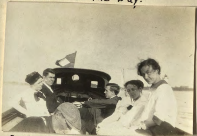
On the way to "Ram Island Lighthouse".

"We don't know as we'll get there - but we're on the way."