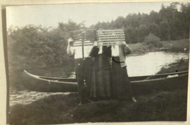
"Behind The Bars."