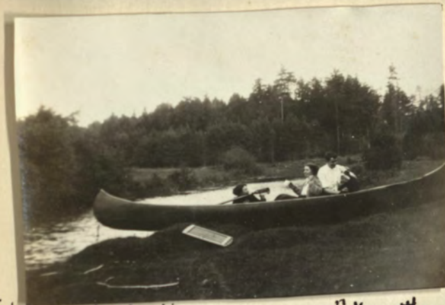
"Too bad she drinks."