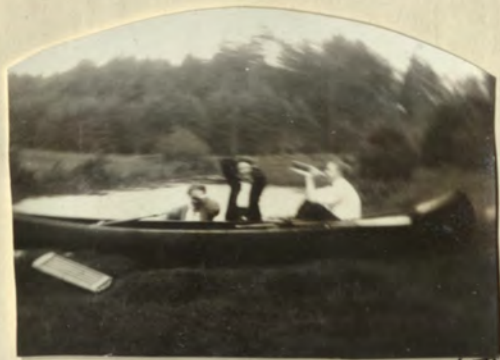
Things getting just a bit hazy. (This was due to mosquitoes, of course.)