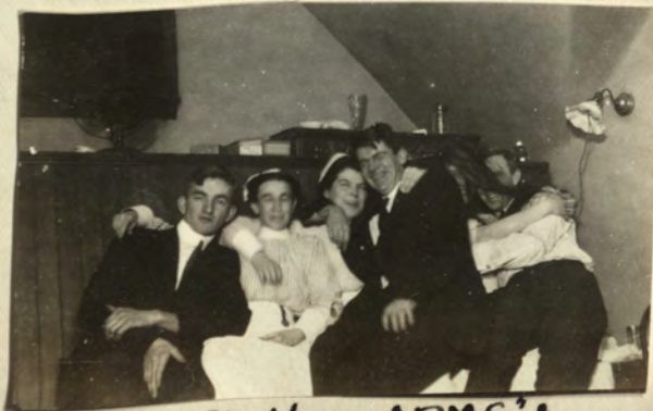
"A few Wires Attached."