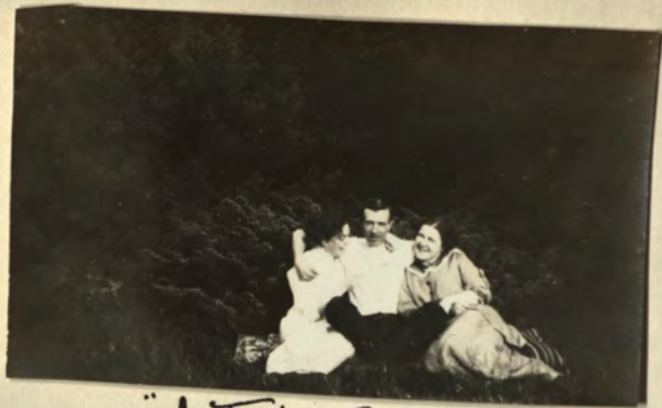
"A Touching Scene."