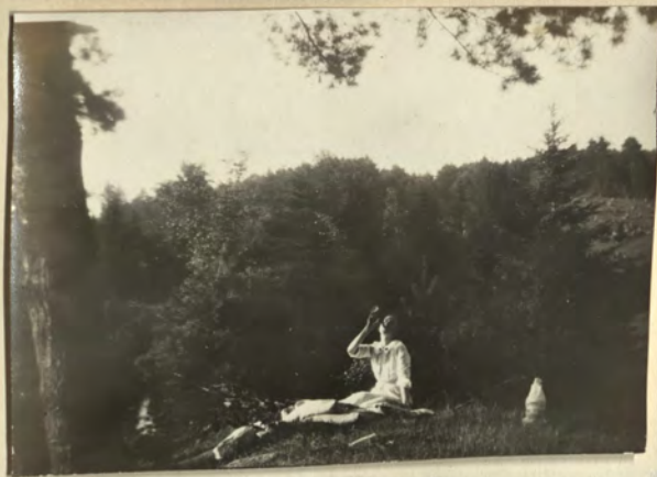
"I wish Boatsch was here."